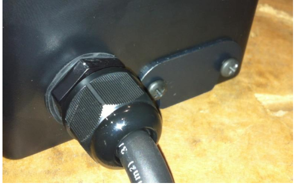
Figure 1. Removable Cover

Disconnect the receiver from the power source. Beside the power input you will see a removable flap with two screws (Figure 1).