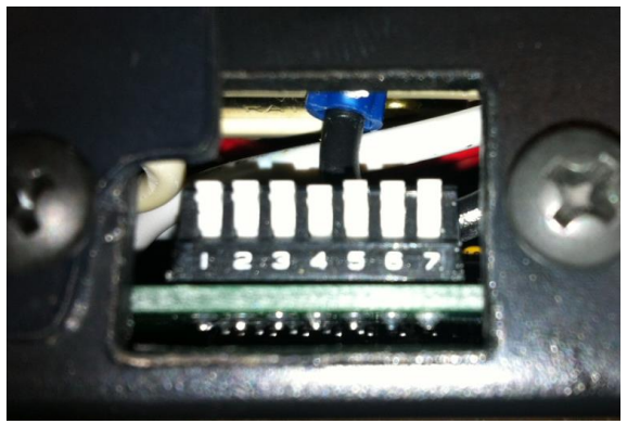
Figure 2. DIP Switches

Carefully loosen the two screws holding the cover in place. Once loosened the cover should easily slide off. Behind the cover you will find the seven DIP switches (Figure 2).