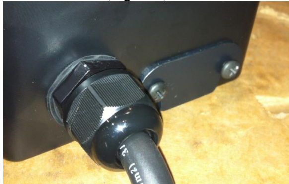
Figure 1. Removable Cover

Disconnect the receiver from the power source. Beside the power input you will see a removable flap with two screws (Figure 1).